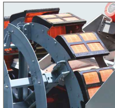
Polyurethane Washing Screens