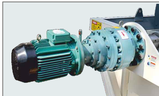
Heavy Duty Motor & Gear Box

Since 1986 Shakti ® MINING EQUIPMENTS PVT. LTD.