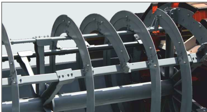
Heavy Duty Classifier with adjustable Wiping Blades